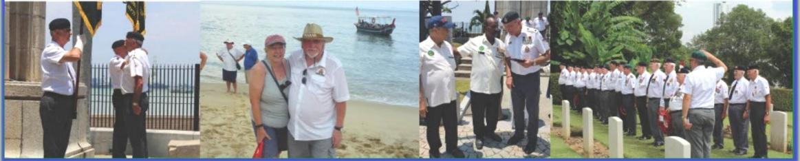
Photos from the 2017 trip