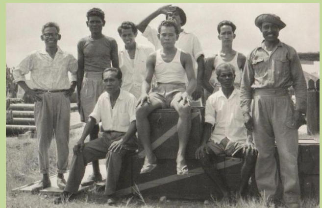
Bomb Dumb labourers