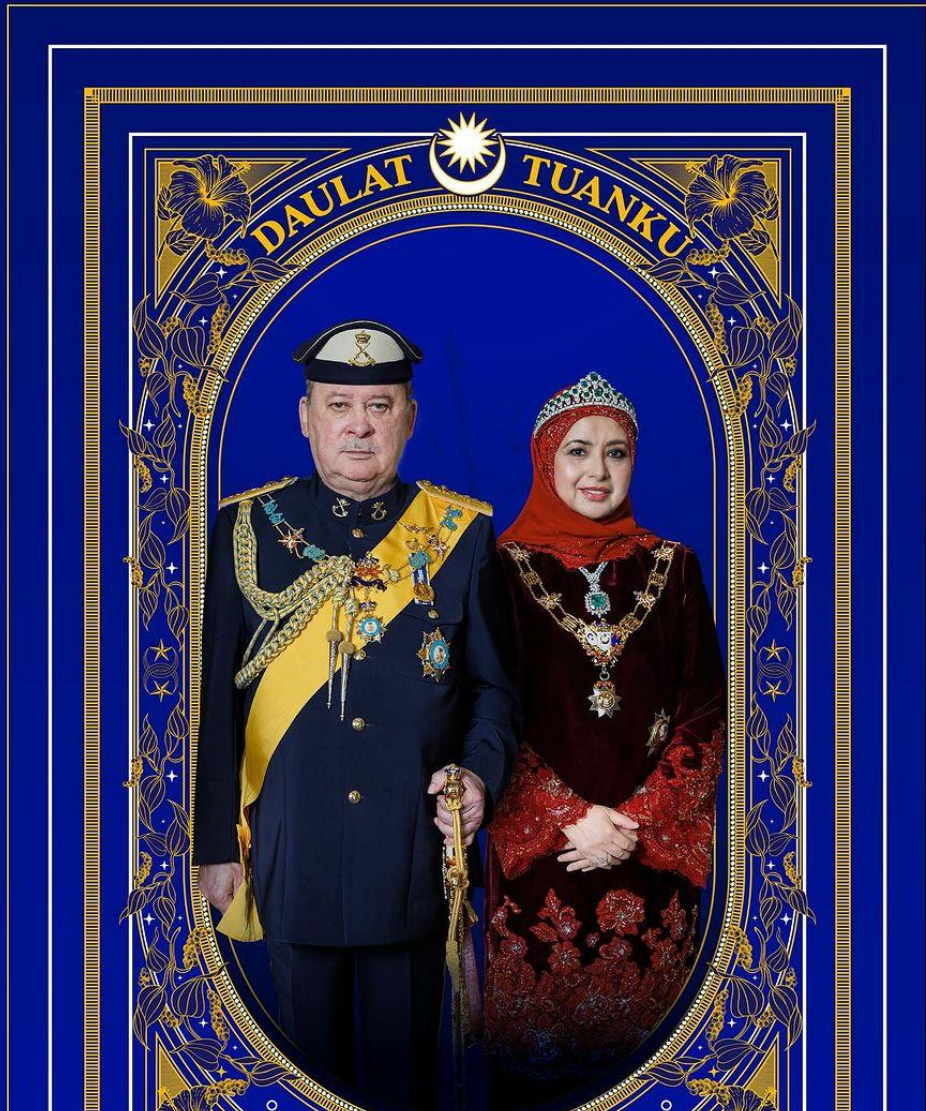
31 st January 2024, 17 th King of Malaysia His Majesty Sultan Ibrahim the King of Malaysia and Her Majesty Raja Zarith Sofiah the Queen of Malaysia