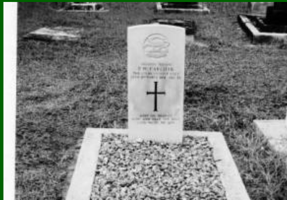
View of some of the Graves